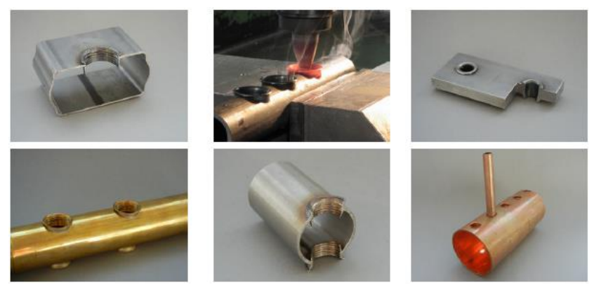
Figure 1. Application examples done using friction drilling process [1].

system manufacturers and related industries, industrial lightening system and light fixture manufacturers, agricultural machine manufacturers, bicycle manufacturers and related industries, manufacturers making any type of tubular products or equipment, building industry, conveyor system manufacturers, lifting system manufacturers, fixturing system manufactures [1] These applications is seen in Figure 1.